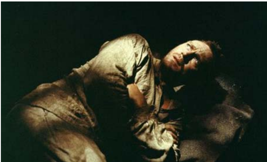
Steve McQueen as Henri Charrière in the 1973 film Papillon, which is being refilmed in the Canaries.